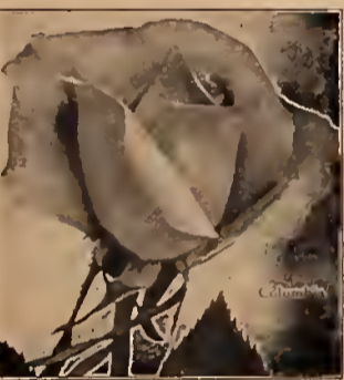
CLIMBING AMERICAN BEAUTY

The Climbing American Beauty is truly the wonder of Rose Land. Our plant will produce twenty times as many blooms as the old American Beauty. Over 800 blooms and buds have been counted on our four-year-old bush. It is perfectly hardy and the foliage is green and beautiful until the snow falls. During this Great Annual Rose Sale the price is just—